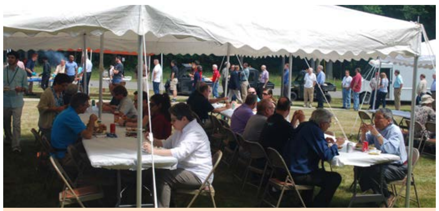
PPPL's Engineering staff enjoyed burgers and hot dogs on the lawn of the Lyman Spitzer Building during the annual Engineering & Infrastructure picnic on June 24.