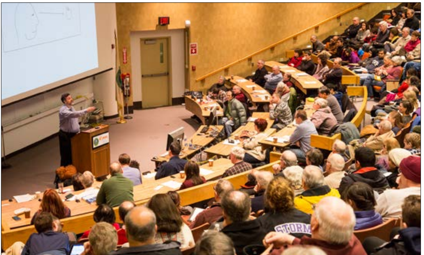
Hundreds of people gathered in the MBG auditorium for the first day of the newly-named Ronald E. Hatcher Science on Saturday lecture series on Jan. 10