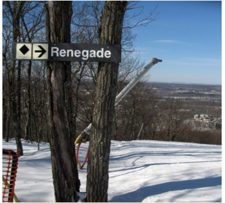
The black diamond trail at Shawnee Mountain.