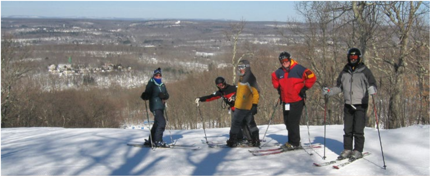
A group of skiers prepares to ski down the hill.