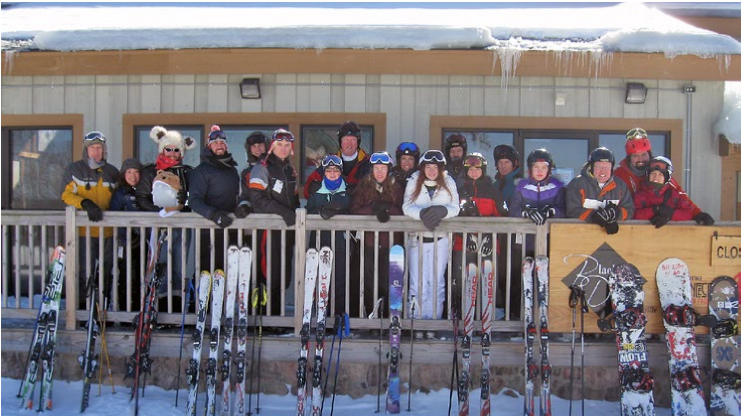
PPPL skiers pose for a photo on the porch of the lodge at the top of the mountain.