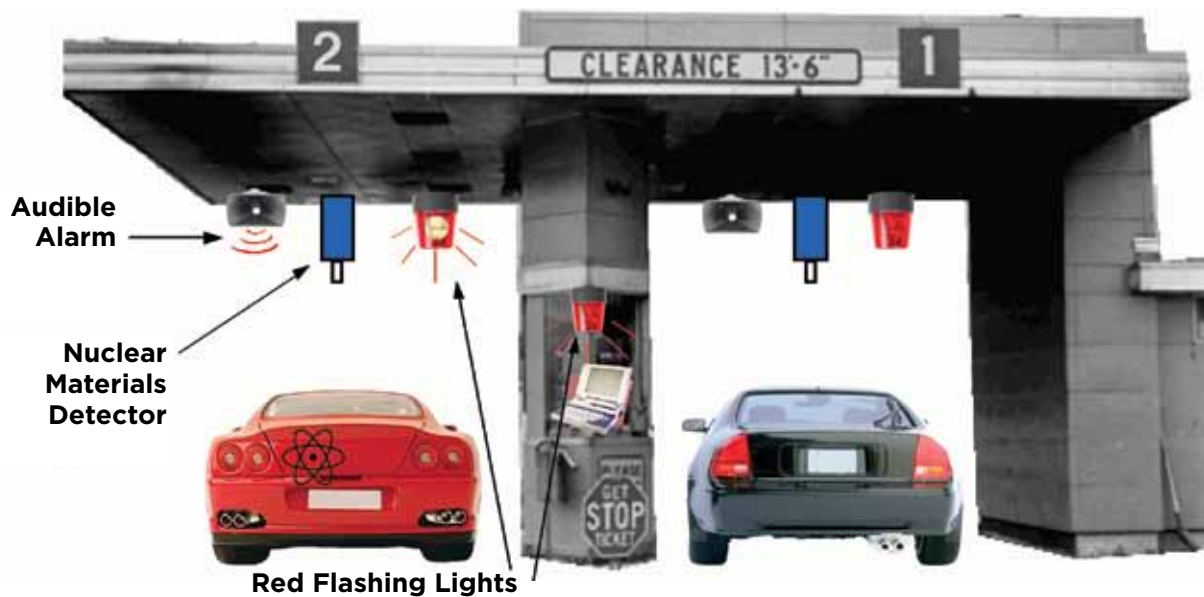
MINDS tollbooth application.

MINDS can detect one-billionth of the material deemed plausible to create a radiological dispersion device — a "dirty bomb." The system can be deployed in a variety of applications, because it is capable of differentiating among naturally occurring radioactive elements, authorized medical and acceptable industrial nuclear substances, and threat materials. By identifying the specific radioactive material present, MINDS eliminates the "car alarm" syndrome, where the operator is accustomed to so many false alarms that future warnings could be ignored. MINDS can be con-