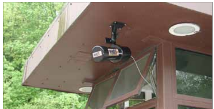
The MINDS detector employed at a guard station.