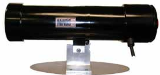
The MINDS detection head is 18 inches in length and 5 inches in diameter.