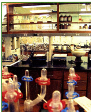
One of the new PEARL labs.

The new facilities include wet, hot, and counting labs, each of which are about 25 feet by 25 feet in size and include oak desks. At the wet lab, staff prepare samples of water from the D-Site LECTs, rainwater, surface water, ground water, soil, and biota, as well as prepare the environmental