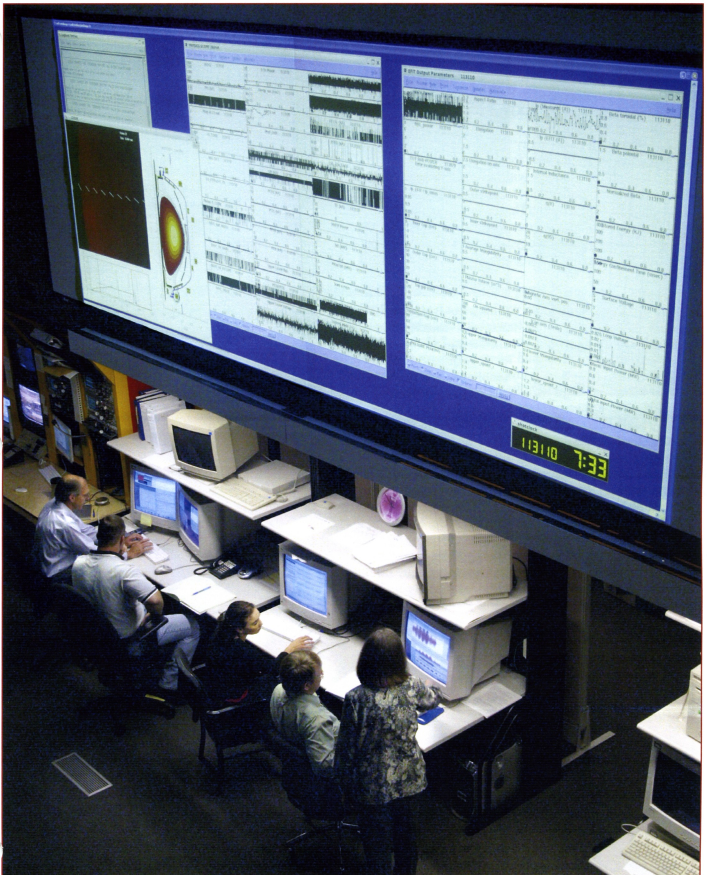
The NSTX Control Room is a hub of activity when the machine is operating. Above, researchers work together during the FY04 run.