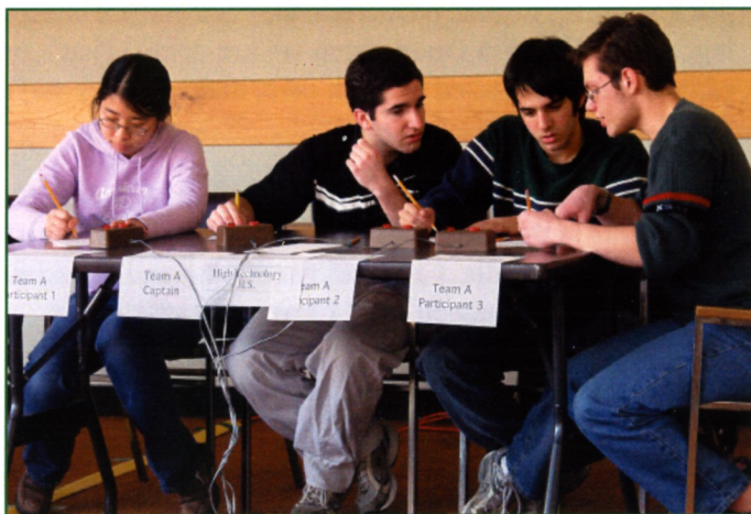
Above, one of the teams confers about a bonus question.