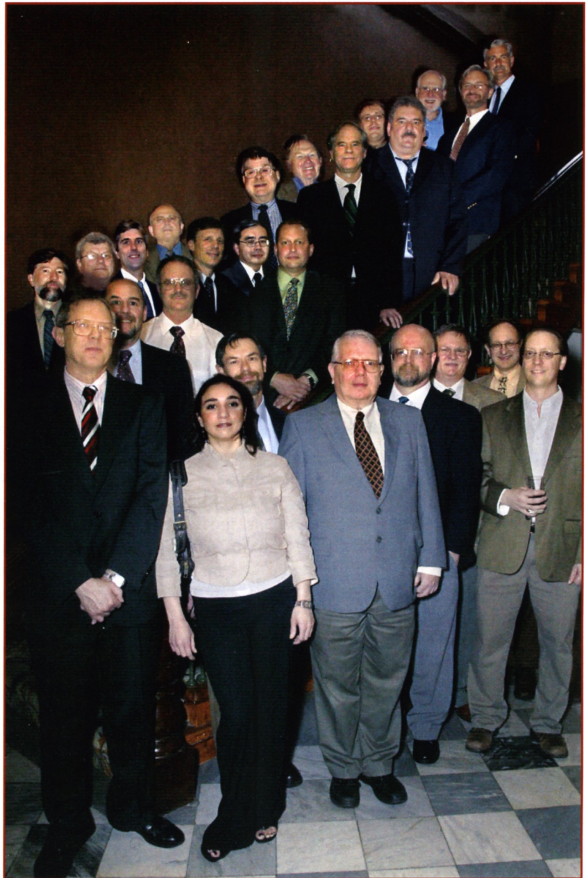
The inventors at the Patent Dinner are above.