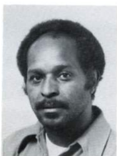
Roland Snead C-Site, PDX