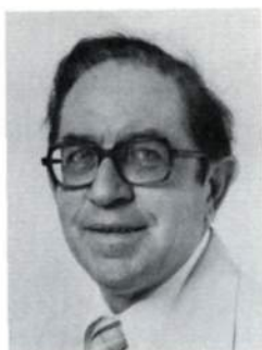
Sal Cavalluzzo Bldg. 1-P