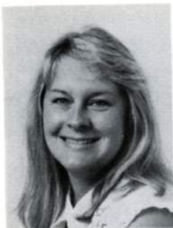
Suzen Bayer C-Site, Mod. 2