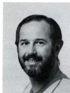
Albert Saboski Tech. Bldg.