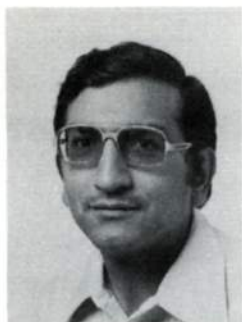
Mounir Awad Bldg. 1-N