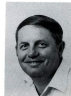
Nelson Rainier Tech. Bldg.