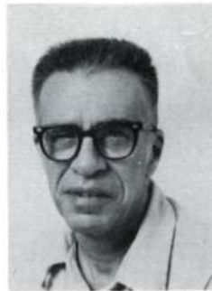
Stuart Foote Bldg. 8-I