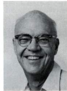
Don Hay Bldg. 8-I