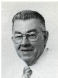
George Beauregard Bldg. 1-K