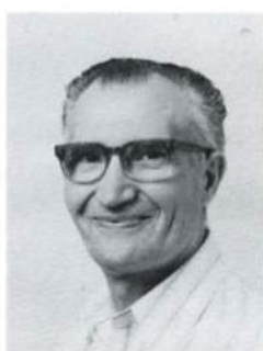
F. Van Reymersdal Aero Lab