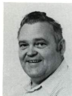
Earle Sheaffer Bldg. 1-N