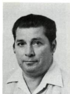
Jim Cook Bldg. 8-I