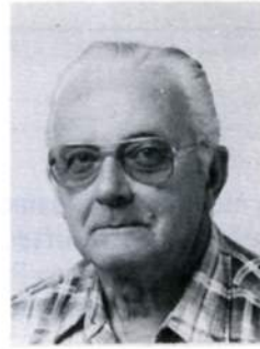
John Byaesko Tech Bldg.