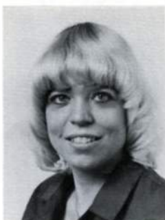
M.J. Hollendonner C-Site, Mod. 2