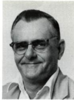
Don Carter Aero Lab