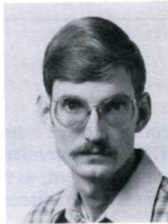
Bill Brinkworth Computer Center