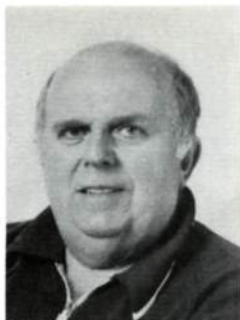
Charles Beach Aero Lab