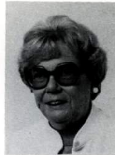
Eleanor Schmitt Sayre Hall