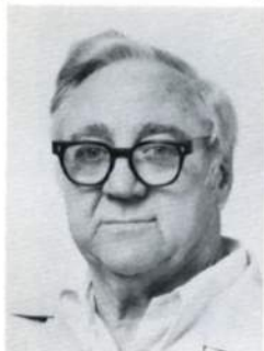
Lee Ellingham Machine Shop