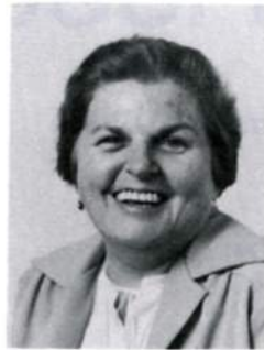
Ellie Weed Bldg. 1-A