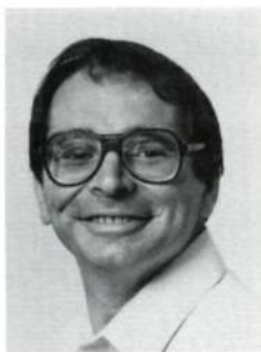
Mel Gensamer Aero Lab