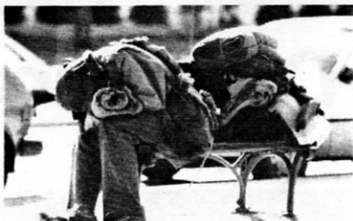
Your donation helps provide shelter for the homeless.

for a family of three while a gift of $20 per week provides diapers and formula for an infant for a full year while living in a shelter for homeless families.