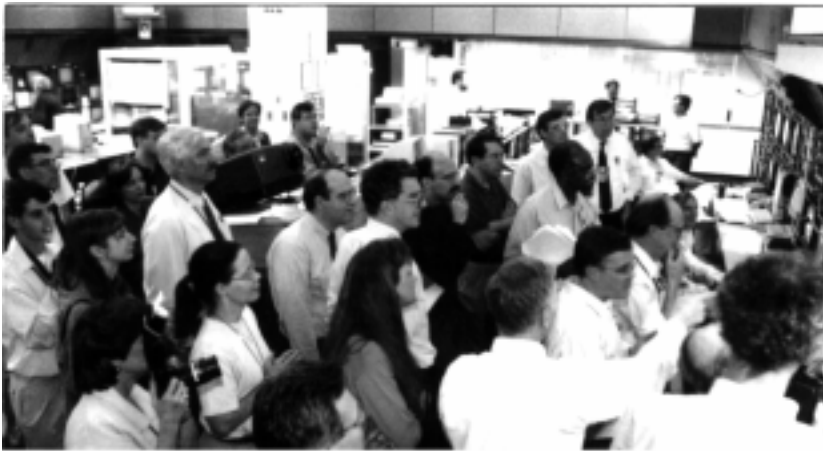
On April 4, experiments on the nation's flagship experimental fusion machine, the Tokamak Fusion Test Reactor (TFTR), concluded. TFTR received wide recognition when it set a world record of 10.7 megawatts of controlled fusion power in 1994 and in 1995 reached a world record plasma temperature of 510 million degrees Celsius. Staffers, reporters, and family and friends gathered around a monitor to watch the results of the final experiments.