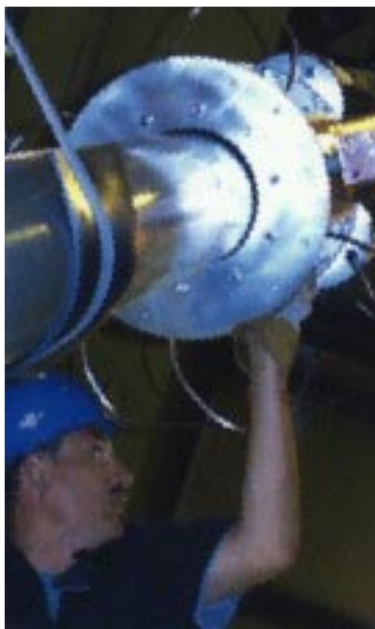
PPPL's Joe Bartzak guides the world's tallest ohmic-heating solenoid as it is lowered over the inner toroidal field coils of NSTX.

Assembly of National Spherical Torus Experiment to Begin in September