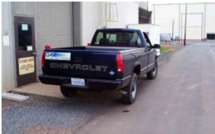
Above is one of PPPL's dual-fuel vehicles. During the next two or three years, PPPL expects to operate five to seven compressed natural gas vehicles.