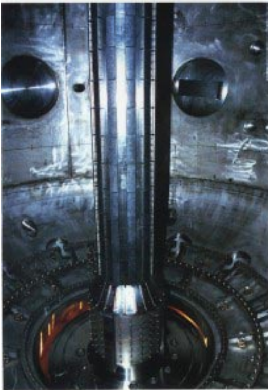
Progress continues on the construction of the National Spherical Torus Experiment (NSTX). Clockwise from top left (page 4), turning over the vacuum vessel; machining the vessel; lifting it into place; inspecting the vessel's legs; and installing the center stack; (page 5) leak testing the vessel; a view of the NSTX Test Cell; installing connections to the center stack; installing the outer toroidal-field coils; installing water racks; and an interior view of the vacuum vessel.