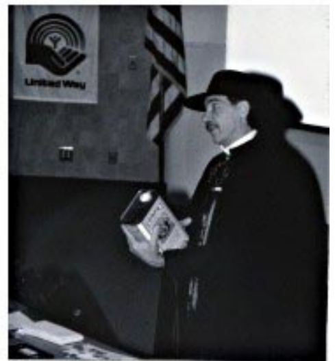
Father Guido Sarducci entertains the group.