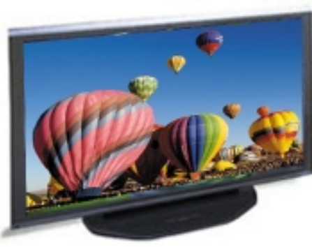
Typical Plasma Display

such as those mounted on buildings in New York City's Times Square. At the present time, small LEDs cannot compete economically with LCDs. Because of fabrication difficulties and cost, neither LEDs nor LCDs are economically viable for the size of screens required for entertainment and business presentation applications. These are the provinces of plasma displays, which involve relatively simple fabrication processes compared to the other flat panels.