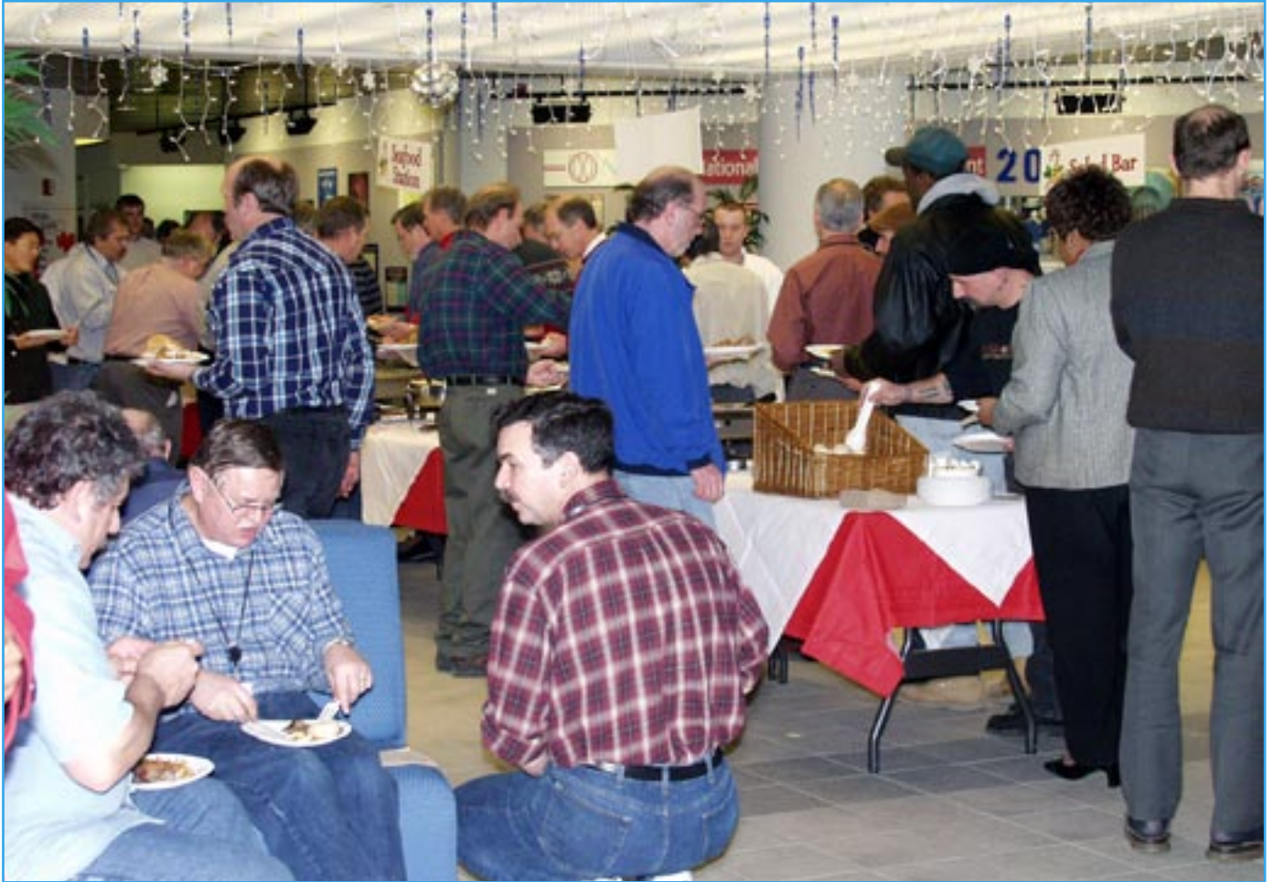
Staff came together December 23 to enjoy the PPPL Holiday Party in the LSB Lobby and the Cafeteria. The festivities featured music by the Unity Community Center Jazz Ensemble, a raffle, and food galore. Above, PPPL'ers fill their plates.