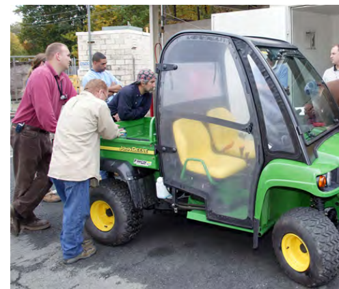
The PPPL biodiesel Gator vehicle.

The Laboratory was among 31 teams and individuals honored for their “outstanding contributions to sustainability.” PPPL, which received a team award, was specifically lauded for its pilot program to use biodiesel fuel in its new utility and existing diesel-powered fleet vehicles. The Lab initiated its vehicle fleet management program in 2006 to comply with Federal mandates to decrease fleet petroleum consumption and increase alternative fuel use. The program launched a biodiesel pilot program in 2007 to introduce employees to alternative fuels to minimize consumer’s resistance to change. The successful use of this fuel in a new utility vehicle — the John Deere Gator — was the first time biodiesel was used in this vehicle. PPPL also reinstated the use of natural gas-powered vehicles. As of Fiscal Year 2010, 73 percent of PPPL’s fleet was composed of alternative fueled vehicles. Alternative fuel consumption was 19 times higher than Fiscal Year 2005 levels, representing more than 77 percent of PPPL’s total covered fleet fuel use. ■