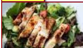
Spinach Salad with Grilled Chicken & Sliced Apples