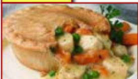
Autumn Chicken Pot Pie

Spanish Omelet with Grilled Onions, Peppers, Mushroom, Cheddar