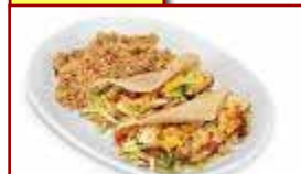
Cilantro Lime Bay Scallops Tacos served with Wild Rice Blend