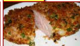
Baked Breaded Pork Chops with au Gratin Potatoes

Sausage Gravy served over Warm Cheddar Scallion Biscuit