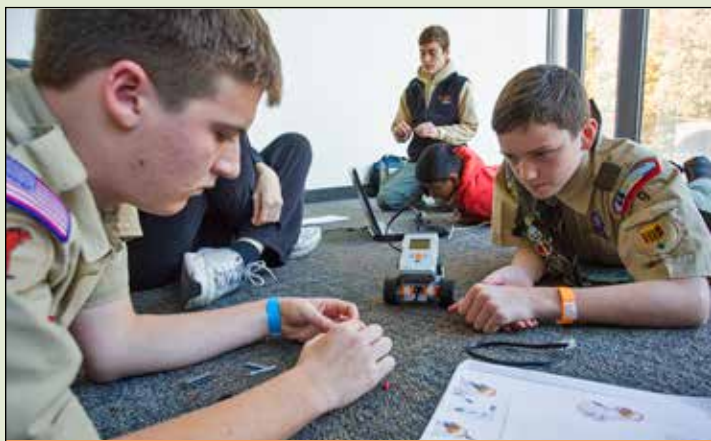
A group of Scouts concentrates intently on constructing their robotic vehicle made from a Lego® Mindstorm kit.