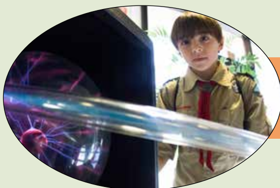
A Boy Scout is fascinated by a demonstration of a fluorescent bulb being lit by a plasma ball in the LSB lobby during the STEM Merit Badge Fair on Oct. 26.