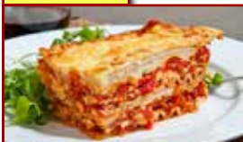
Baked Spinach & Mushroom 3 Cheese Lasagna served with Tossed Caesar Salad

Baked Oatmeal with Blueberries & Bananas