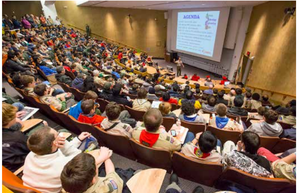
Boy Scouts filled the MBG Auditorium when PPPL hosted 250 Boy Scouts for the STEM Merit Badge Fair on Oct. 26.

W hen PPPL hosted some 250 Boy Scouts for the STEM Merit Badge Fair on Oct. 26, there were Boy Scouts all over the Laboratory: creating robotic cars, doing chemistry experiments, sending messages on Ham radios and using sophisticated CAD programs.