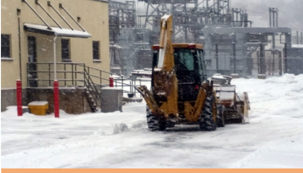
A back hoe operator clears snow during the snow day Jan. 27.