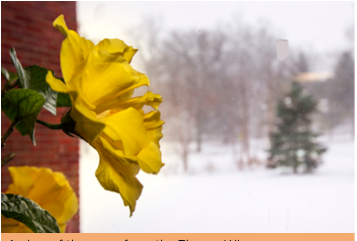
A view of the snow from the Theory Wing.