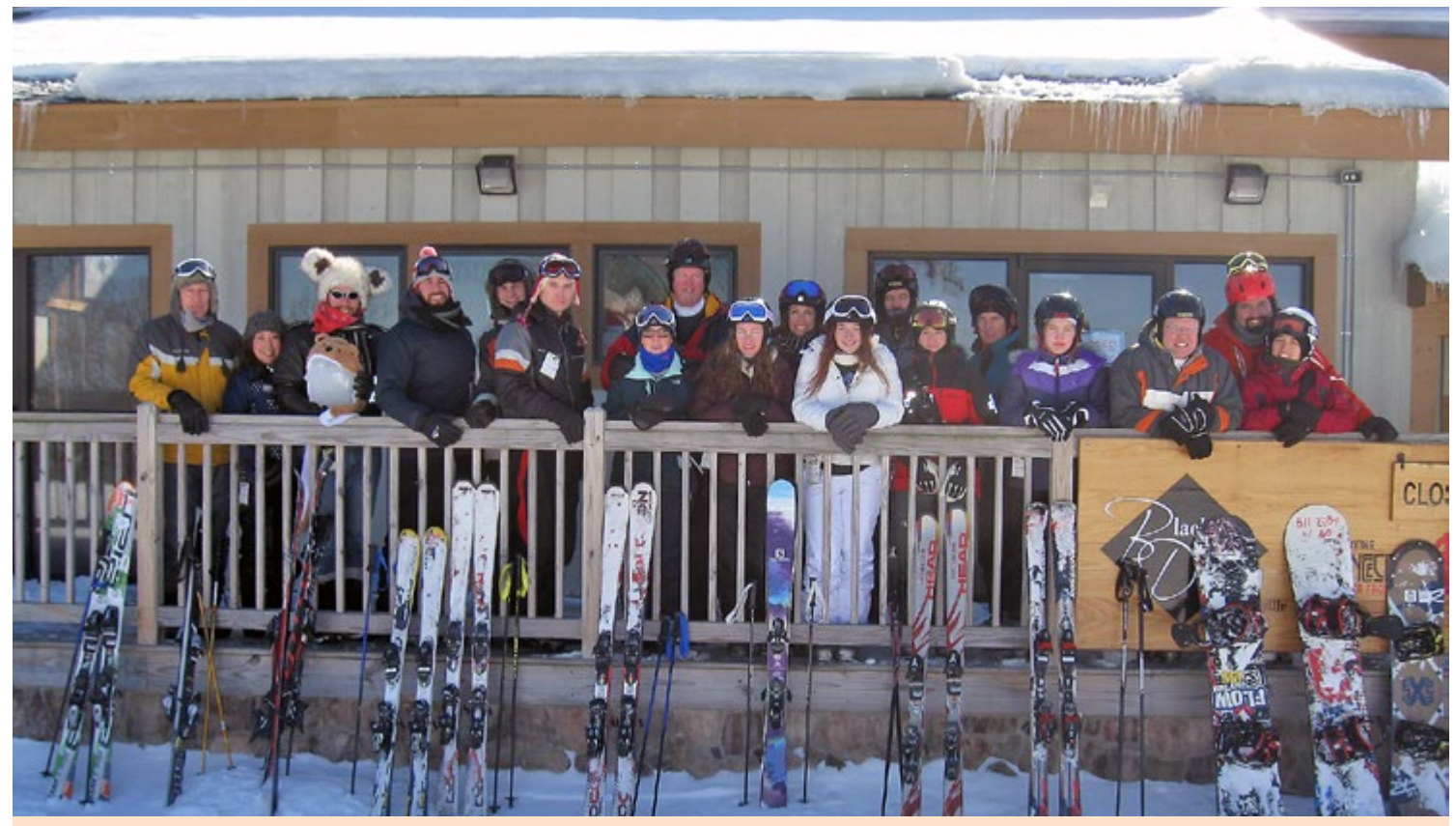
PPPL skiiers pose for a photo on the porch of the lodge at the top of the mountain.