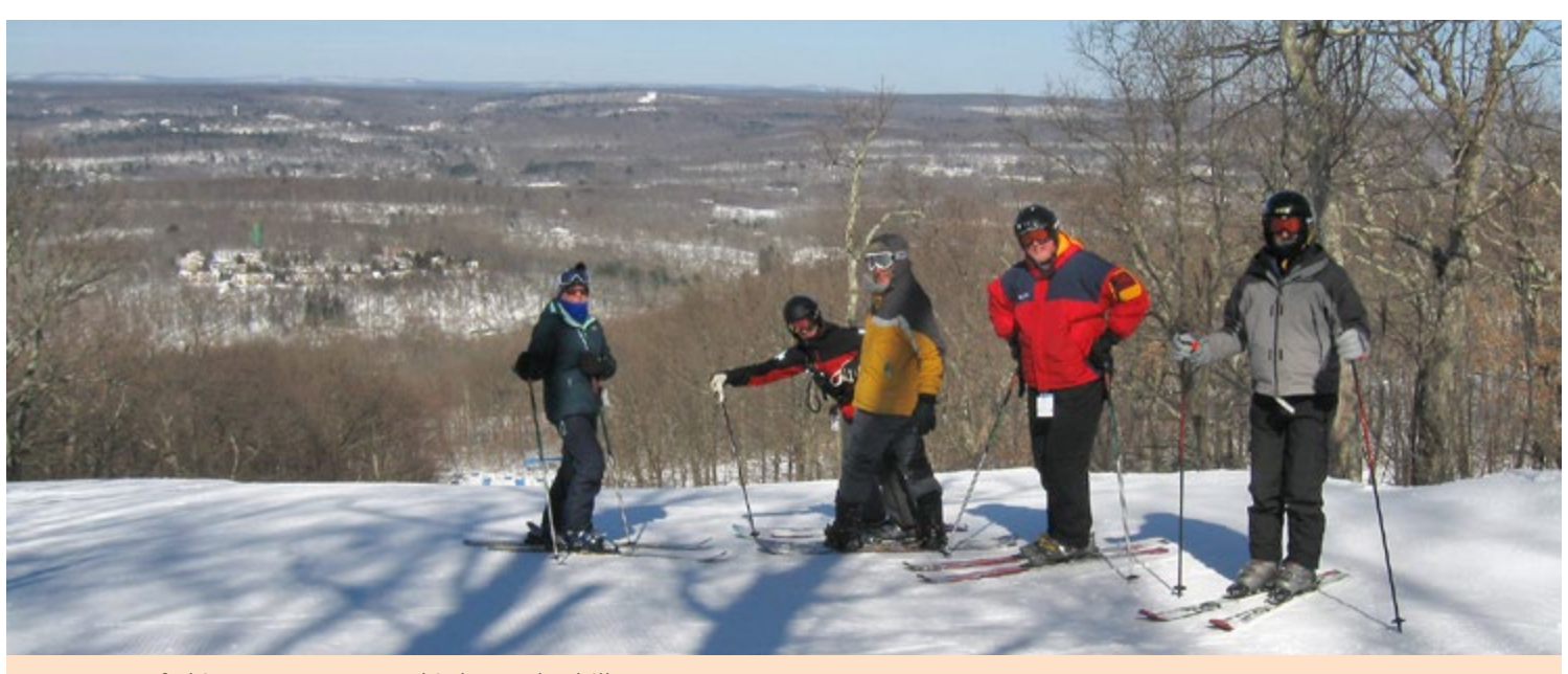
A group of skiers prepares to ski down the hill.