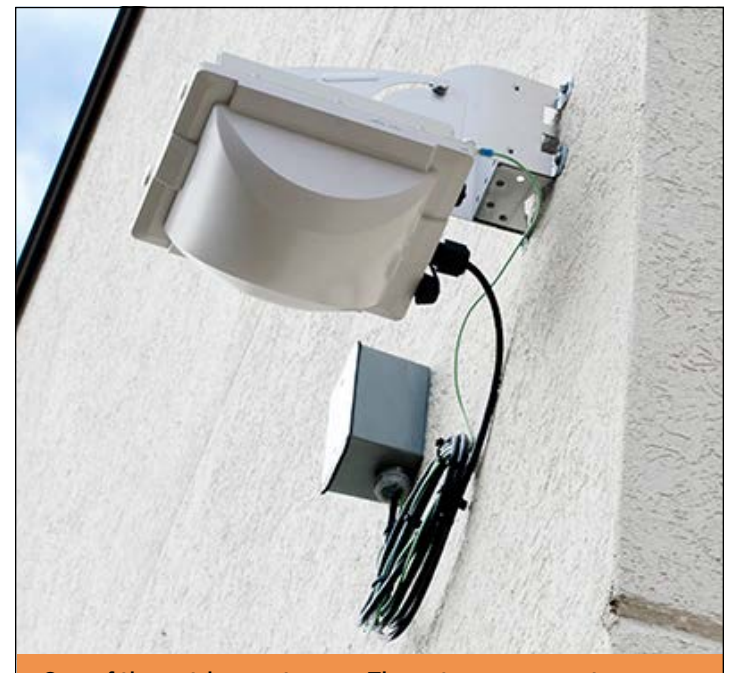
One of the outdoor antennas. The antennas are waterproof and have their own heating systems to operate in any weather.

One recent incident demonstrated the advantages of the Night Owl program. When PPPL received a report that there were two armed individuals in the area nearby, the Communications Center expanded the map to show the location of the men and Plainsboro Police on the Night Owl map so any officer on site would see it and sent out email and radio bulletins to officers on patrol. In the end,