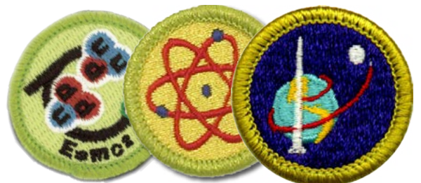
Pictured at left are the various Merit Badges Boy Scouts can earn at PPPL, including above from left: nuclear science, energy and space exploration.