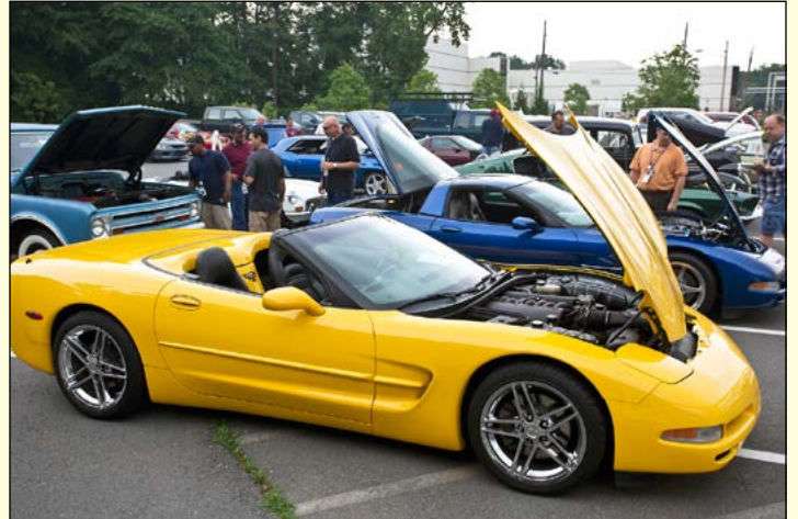
A 2001 Corvette Convertible in millennium yellow owned by Lew Morris with its hood up.